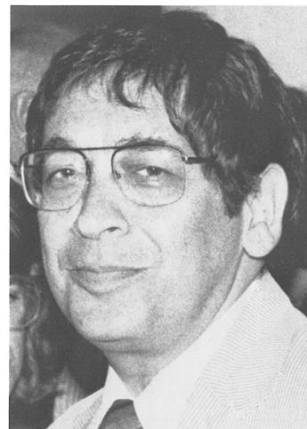
Congressman Ted Weiss, who was the speaker at the dedication.

The sheetfed division contains 33 offset cylinders that operate on a multishift basis. There are also six letterpresses. The web division has a four-color perfecter that can color both sides of a web at full press speed and at the same time print four colors in line and a single pass and deliver sheets or folded signatures. There is also a two-color business forms press with a flexo unit and carbon interleaving attachments.