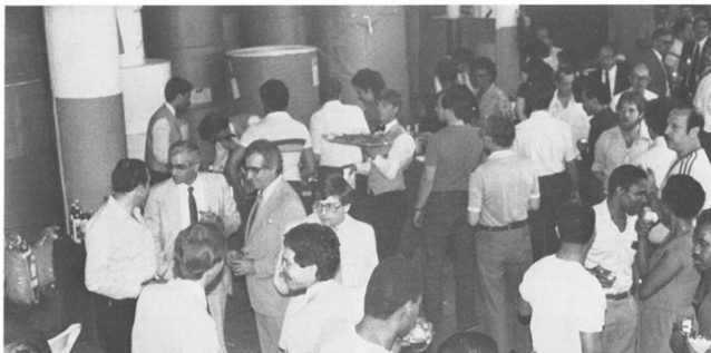
A small part of the crowd at the dedication.